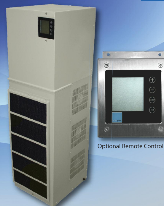
Optional Remote Controller