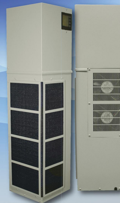
Qube Series 5000 BTUH Model