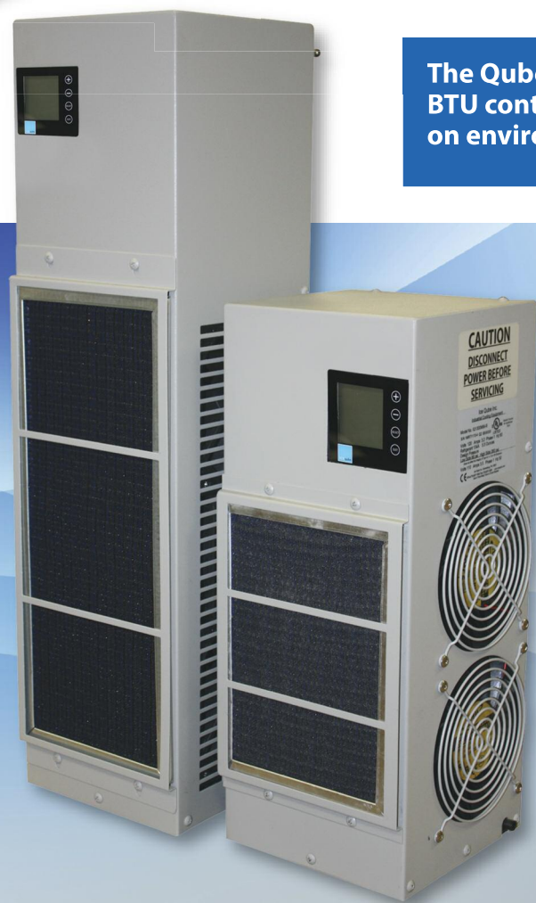
Qube Series 1000 & 2200 BTUH Models

The Qube Series Can be used in multiples to provide precise BTU control, and operate from 1000 to 9000 BTUH depending on environmental conditions.